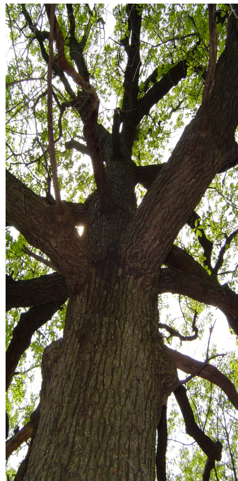
A large oak stretches out towards the sun—Kristen Wilhelm