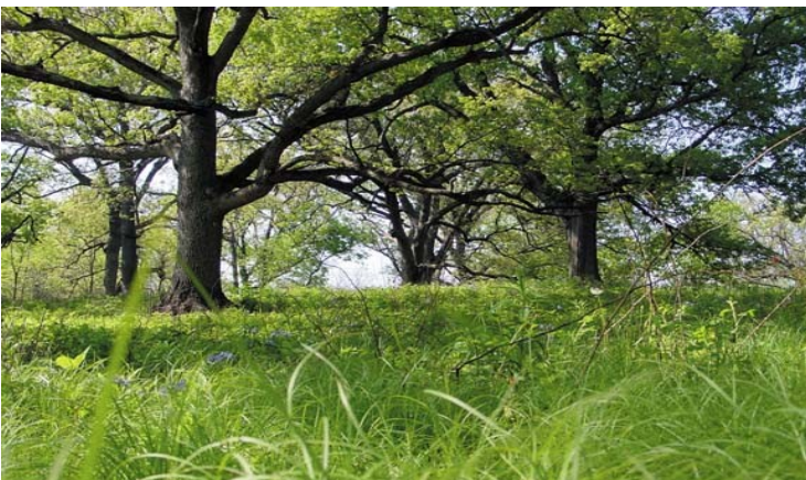
An example of an oak savanna. This is how we hope to restore the Franklin Savanna.