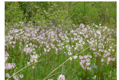
Shooting Star

9724 W Forest Home Avenue, Hales Corners, WI 53130-1618