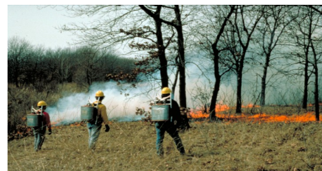
An example of a controlled burn for management purposes